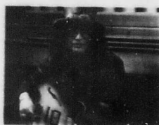
Slash will bring his touring S.E.R.P.E.N.T. Festival to Red Butte Garden on July 16.

Utah loved the New Wave in the '80s, and that love never went away. So there should be appreciative audiences at Sandy Amphitheatre on Friday and Saturday, August 16 and 17, when two of the acts who sprang from that era — Howard Jones and Martin Fry's ABC — headline. The novelty is their opening act: The British band