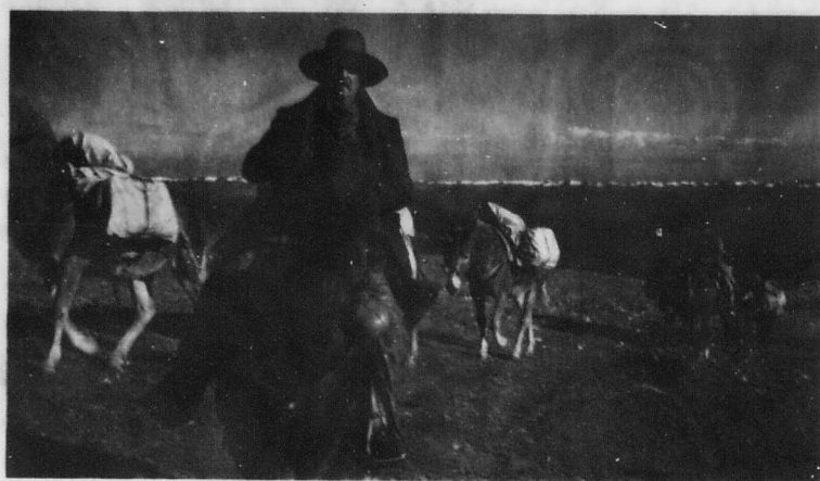
Kevin Costner is one of the actors featured in "Horizon: An American Saga." The four-movie series was filmed in southern Utah. The first installment is scheduled to be released June 28 and the second on August 16.

May 31 ▶ A dog, living alone in an apartment in New York, sees a commercial for a robot companion and buys one. That begins Spanish director Pablo Berger's first animated feature, an Oscar nominee earlier this year, which follows Dog and Robot through their summer adventures — and what happens when they're separated at summer's end. The movie whimsically and wordlessly explores friendship, memory and the connection found in the perfect summer-jam song.