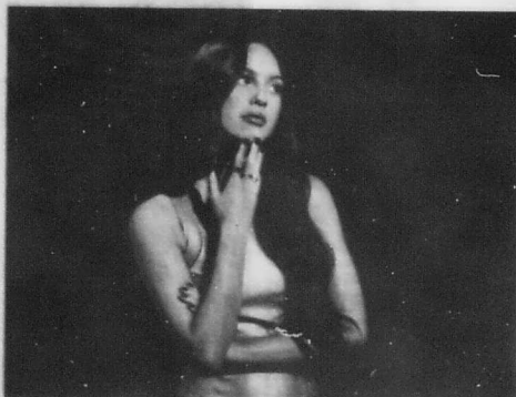
Olivia Rodrigo will bring her "Guts World Tour" to Salt Lake City's Delta Center on July 31.

The 21-year-old pop star Olivia Rodrigo is returning to Utah — where she wrote songs on her first album, "Sour," while